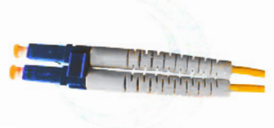
LC Flexi-Boot OS1 Singlemode

AVAILABLE LENGTHS: 0.5m, 1m, 1.5m, 2m, 3m & 5m